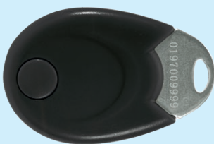
KCP8000 proximity keyfob for residents

BATICONNECT CLOUD 24/7/365 Programming at any time from anywhere www.baticonnect.com